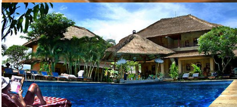
PURI SARON HOTEL (4*)