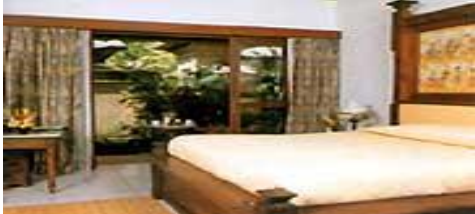
BALI AGUNG (3*)

Validity 01 January 2010 – 31 October 2010