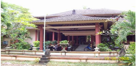
THE PATRA BALI (5*)