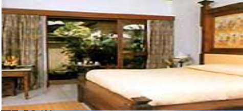
BALI AGUNG (3*)