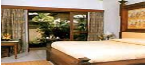
BALI AGUNG (3*)