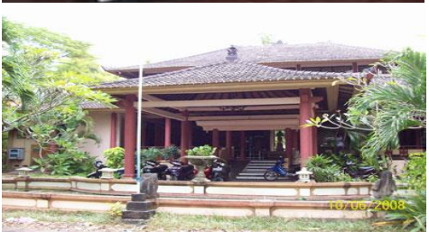
THE PATRA BALI (5*)