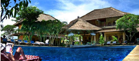
PURI SARON HOTEL (4*)