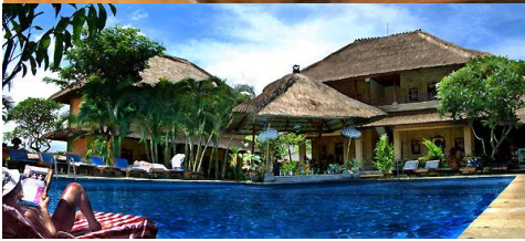
PURI SARON HOTEL (4*)