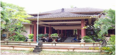
THE PATRA BALI (5*)