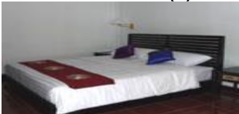
PURI SARON HOTEL (4*)