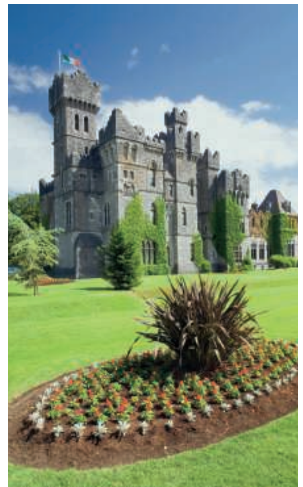
Stay at Ashford Castle, former estate of the Guinness family and dating back to 1228

DAY 8 – DUBLIN Departure transfers arrive at Dublin Airport at 07:00, 09:00 & 11:00. (B)