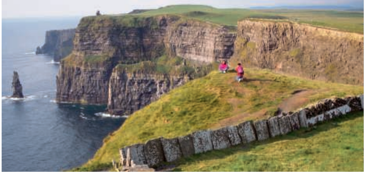
Magnificent Cliffs of Moher

A stylish outing which stays at the distinguished and luxurious Ashford Castle, all the while showcasing the very best sightseeing and scenery Ireland has to offer.