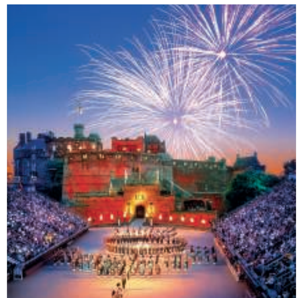
Attend the spectacular Edinburgh Military Tattoo (on selected departures)

DAY 11 – BRONTË COUNTRY – LONDON. Travel south to visit Warwick Castle, with its magnificent medieval towers and ramparts perched on a crag above the River Avon. The chilling dungeon contrasts with the splendour of the State Rooms and baronial Great Hall. Return to London where you bid farewell to your Tour Director and your tour comes to an end. (B)