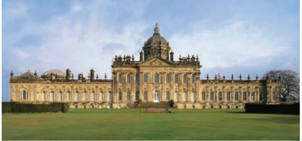
Highlight visit to magnificent Castle Howard

While you might not meet Mr Darcy, this tour certainly evokes a bygone age, imbued with archetypal villages, stately homes, historic castles and gardens.